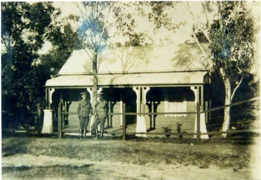
36 Rosa Street, Oatley End of World War I