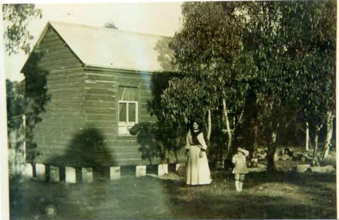
36 Rosa Street (Now 46) Before World War I