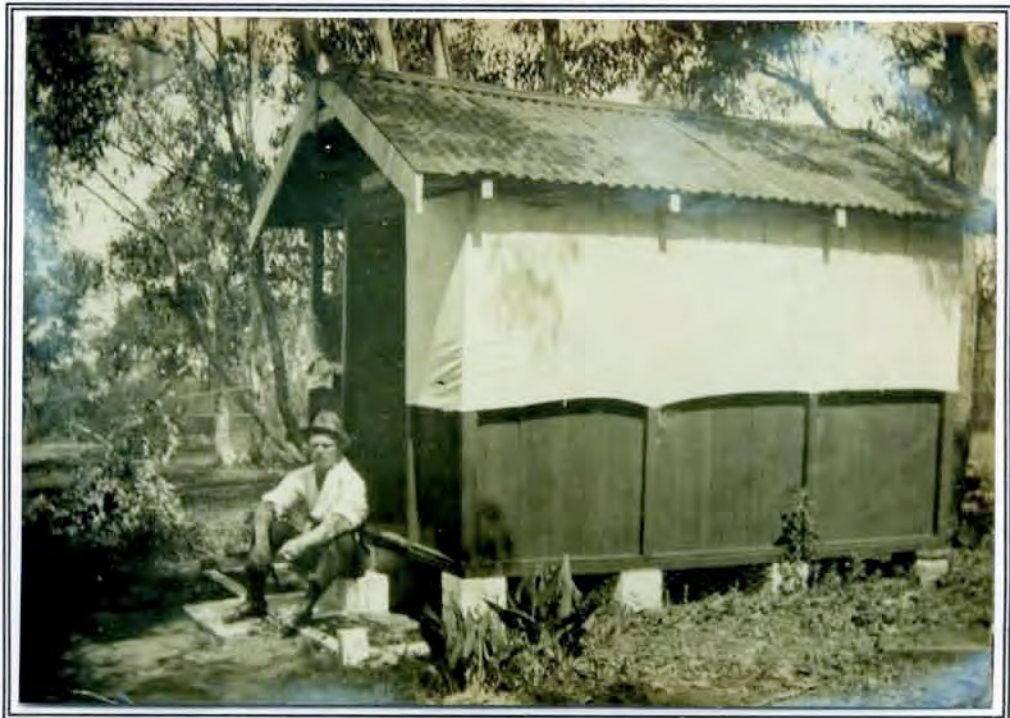
▼ "Diggerville" in rear of 36 Rosa St - (now No. 46) - see story ▼

IN FRONT OF "DIGGERVILLE" (HOUSE OF THE DIGGERS)