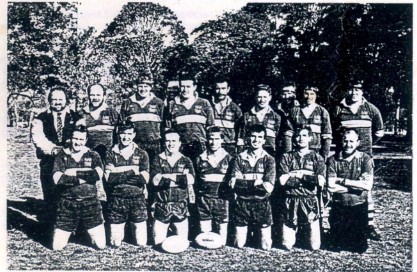
The 1992 Barraclough Cup Team