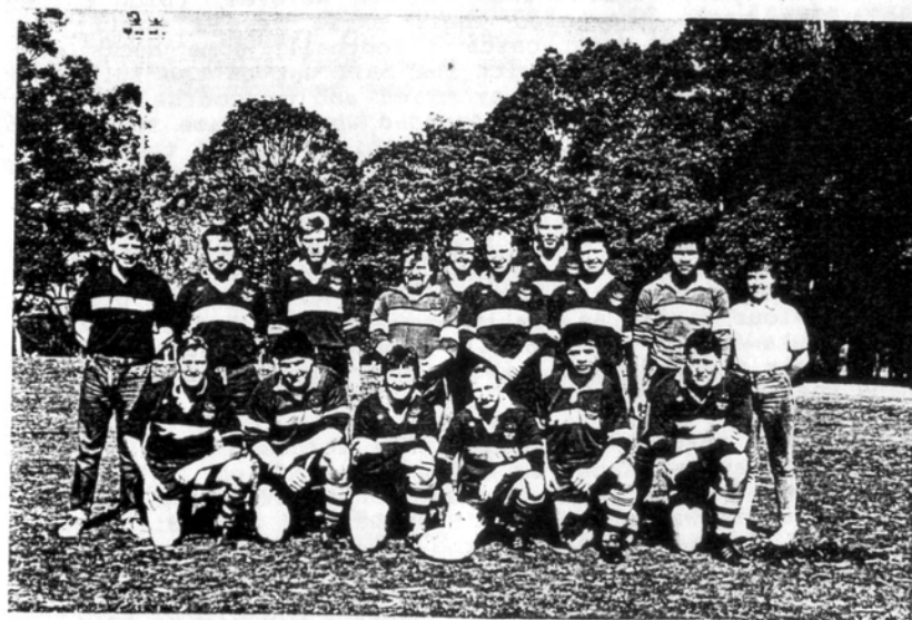
The 1992 Blunt Cup Team

Life Insurance, Superannuation Plans Fire - Accident - Household All Classes of General Insurance Insurance Investments