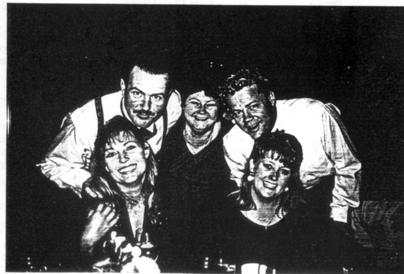
Having a good time at the William Webb Ellis Presentation Night