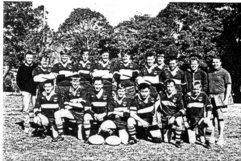
The 1992 Stockdale Cup Team

Specialising in all types of building and maintenance services