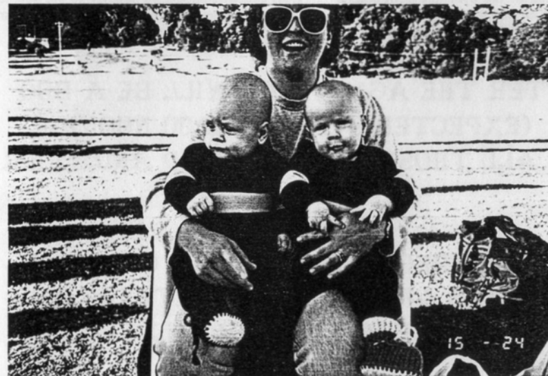
The NEW GENERATION OF OATLEY PLAYERS