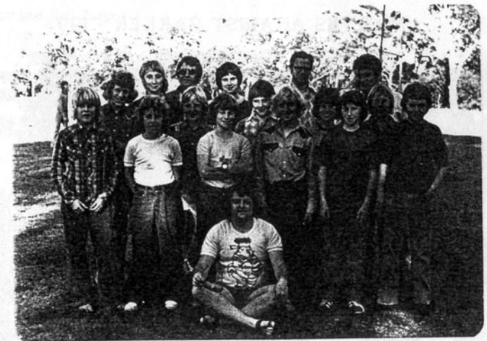
Managing some of our