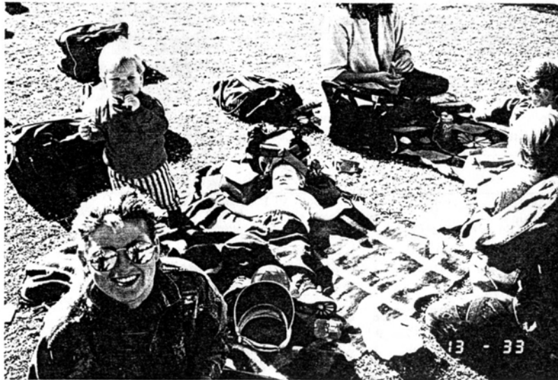
A DAY AT THE RUGBY