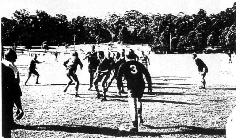
THE 5'S WITH THE OATLEY OLD BOYS