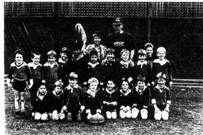
1993 UNDER 7'S