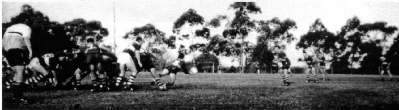
Fitzy moving the ball out to the backs