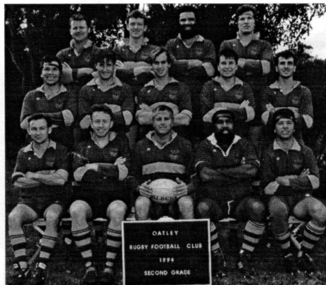
2nd Grade 1994