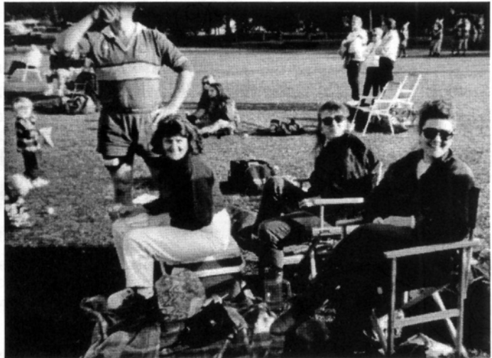
Some of our Loyal supporters