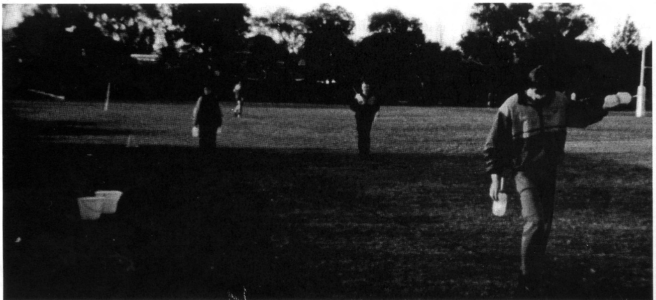
The under 14's running the water for 1st grade .....