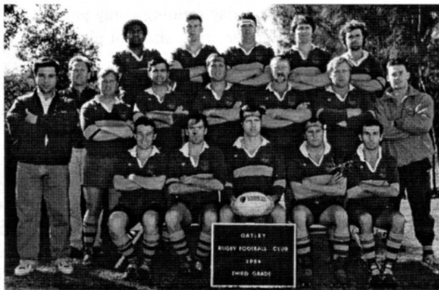
3rd Grade 1994