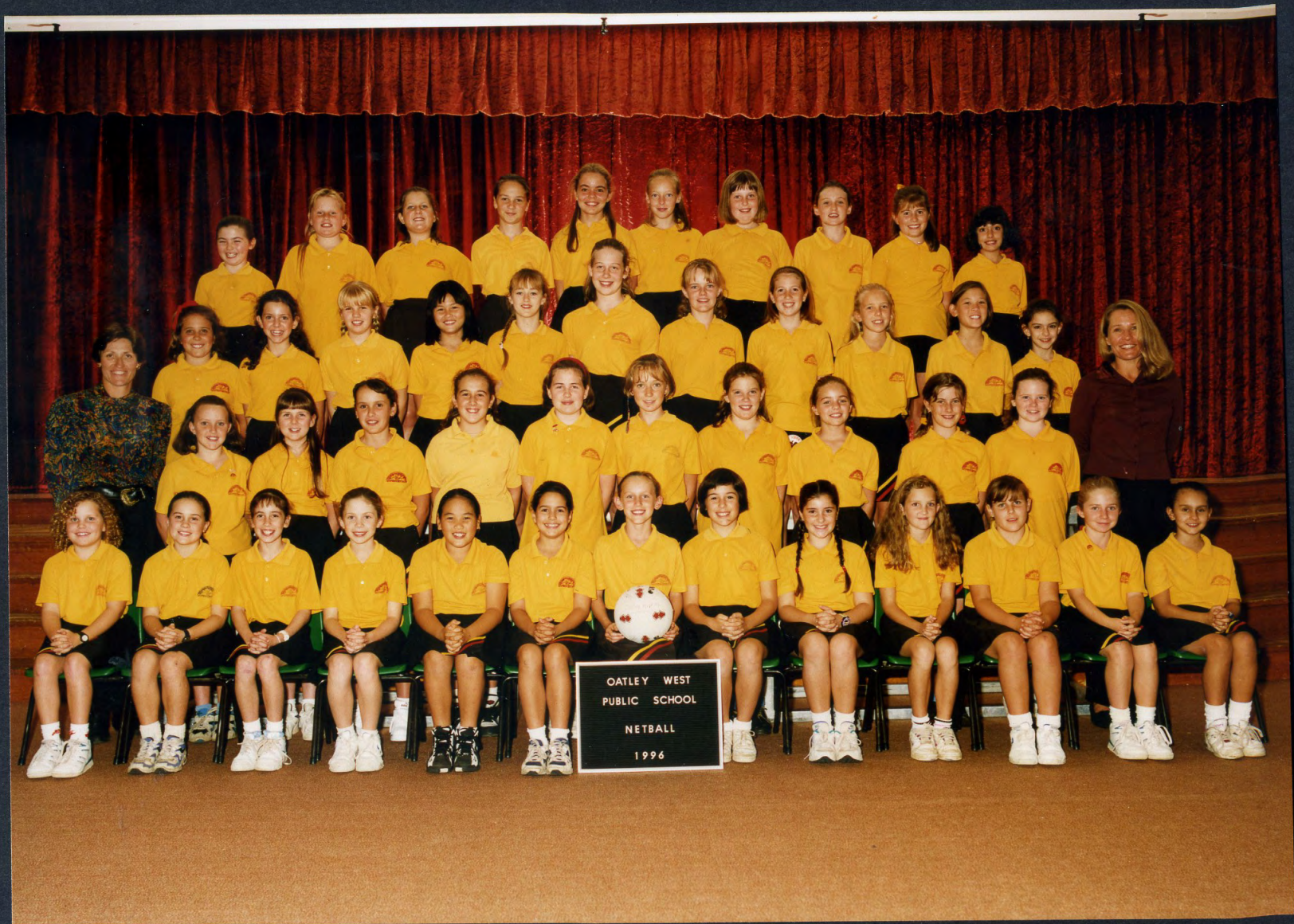
OATLEY WEST PUBLIC SCHOOL NETBALL 1996