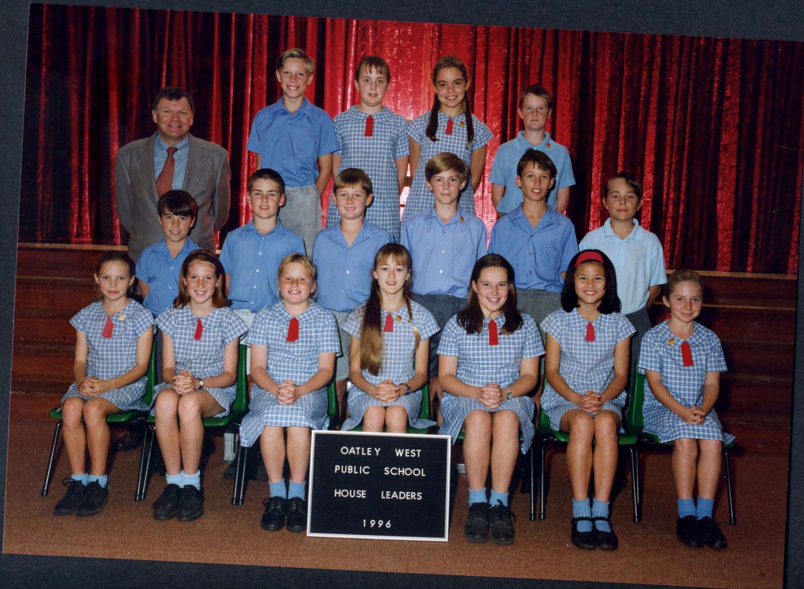
OATLEY WEST PUBLIC SCHOOL HOUSE LEADERS 1996