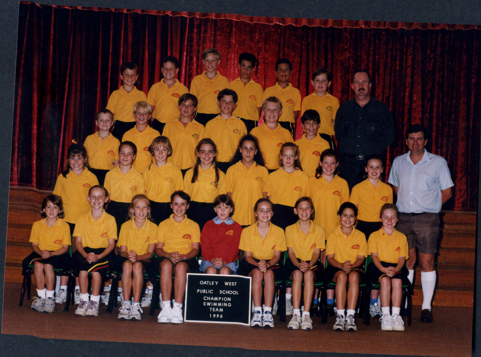
OATLEY WEST PUBLIC SCHOOL CHAMPION SWIMMING TEAM 1996