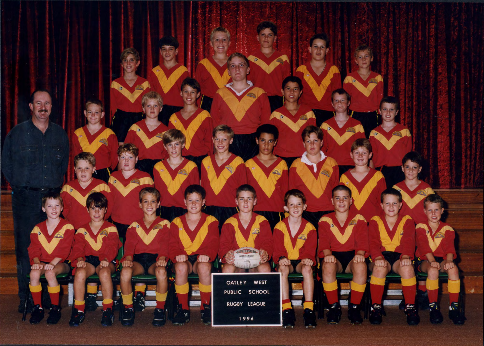
OATLEY WEST PUBLIC SCHOOL RUGBY LEAGUE 1996