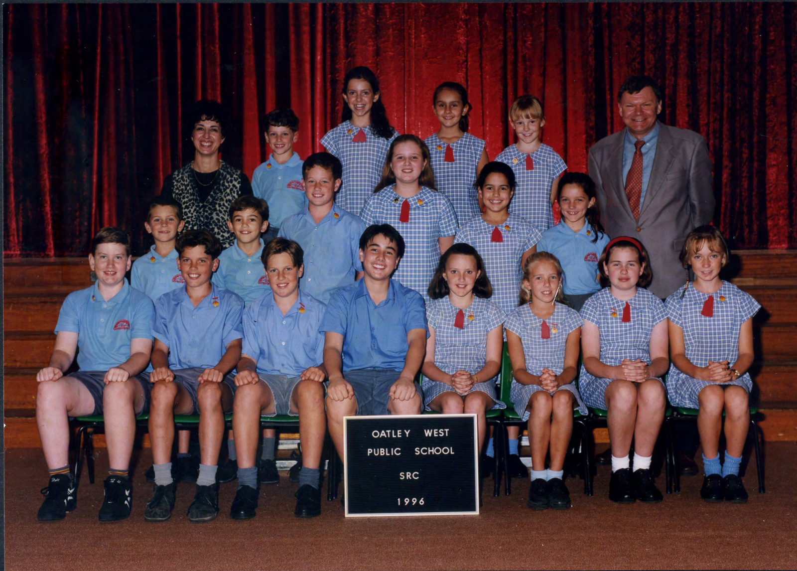
OATLEY WEST PUBLIC SCHOOL SRC 1996