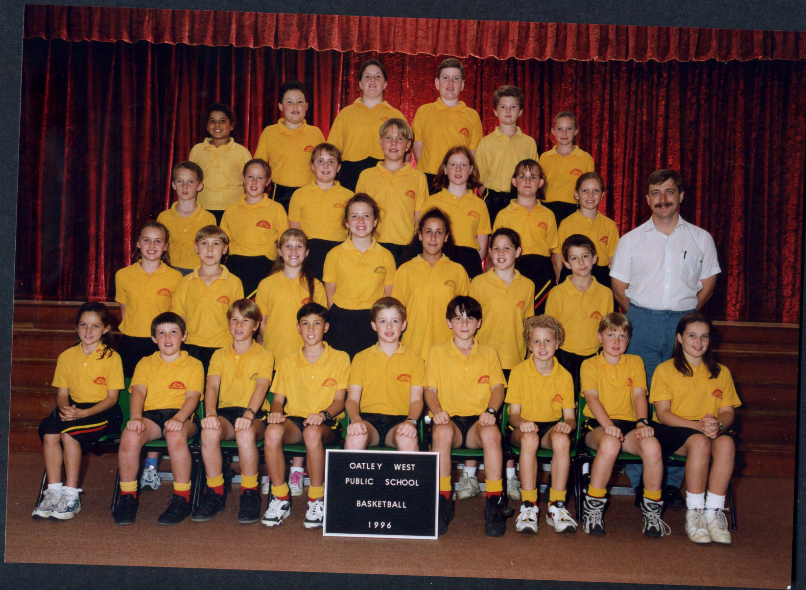
OATLEY WEST PUBLIC SCHOOL BASKETBALL 1996