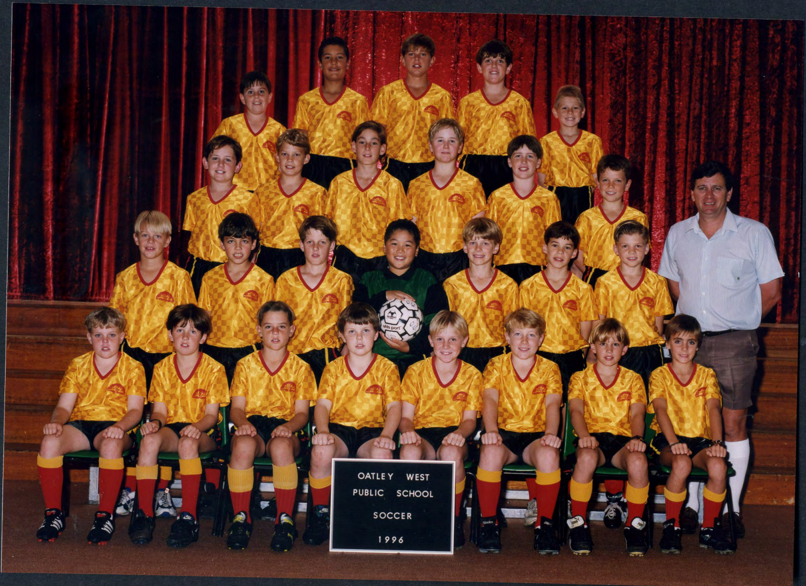
OATLEY WEST PUBLIC SCHOOL SOCCER 1996