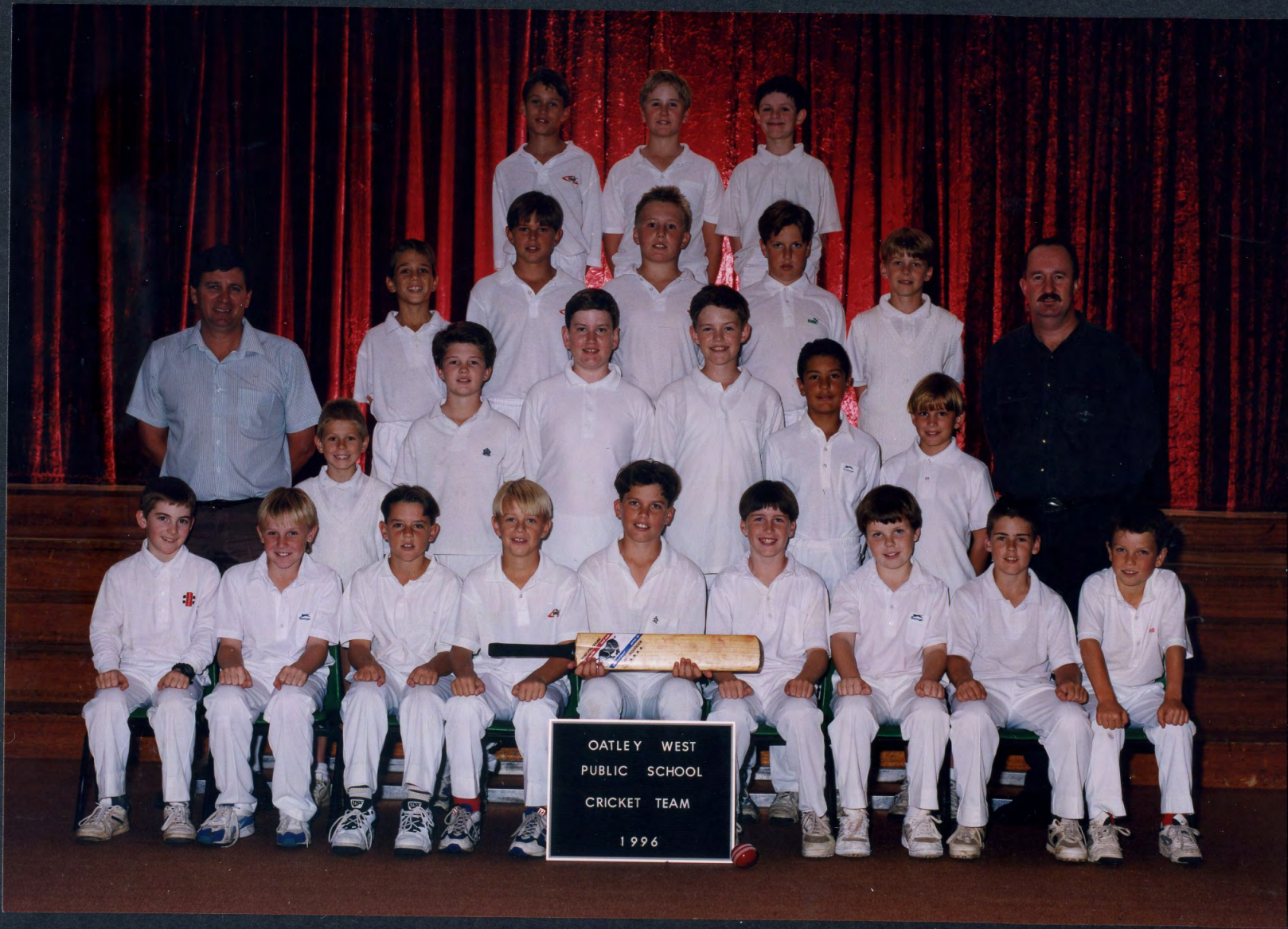
OATLEY WEST PUBLIC SCHOOL CRICKET TEAM 1996